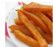
Sweet Potato Fries

My Name _____ My Grade _____ My School _____ My Teacher _____