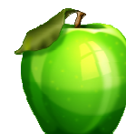
Granny Smith Apple